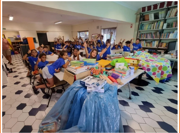
Grateful school children in Portugal

The joy and gratitude from the students was very apparent. Thank you, Grand Prior, for showing the love of God in the battle against need and ignorance.